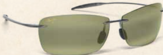
STYLE SHOWN: LIGHTHOUSE

Please visit www.mauijim.com to review our entire collection of styles available.