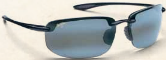
STYLE SHOWN: HO'OKIPA

Maui Jim's optically correct, distortion-free lens featuring patented lens treatments or rare earth elements to infuse views with color.